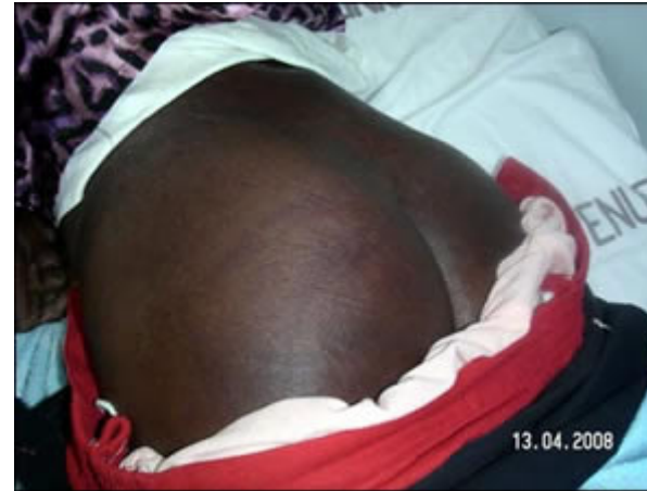
The women shown in the images above were viciously beaten and have sustained deep tissue bruising of the buttocks. All were admitted to hospital. These attacks took place on Friday night, April 11, 2008.