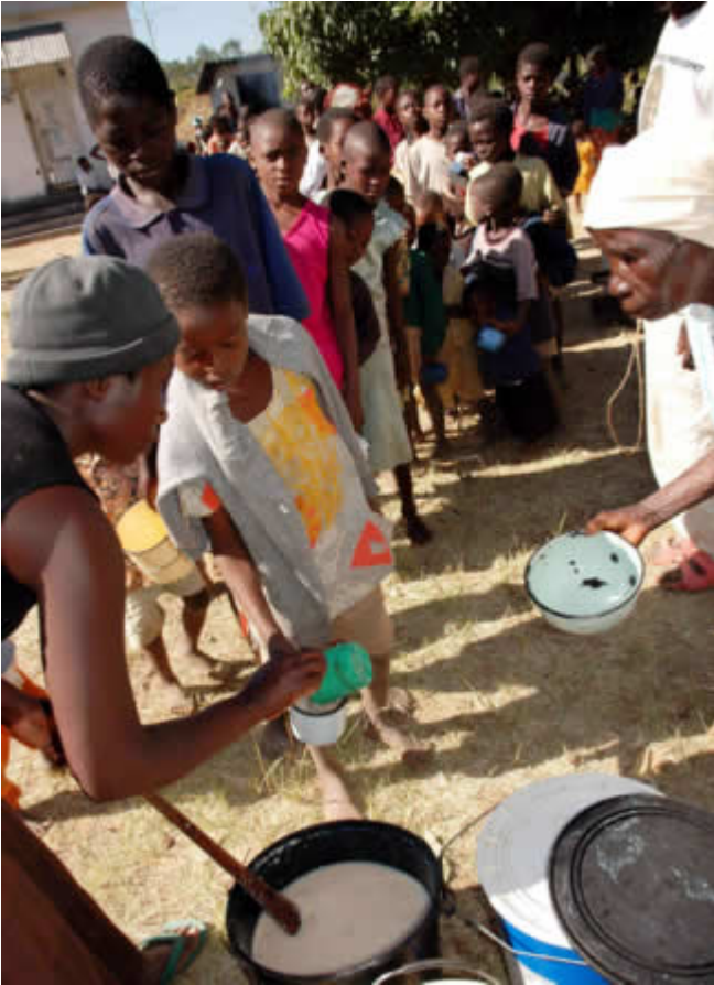
Children queue for the little food that is available.

Efforts are being made to feed these displaced farm workers. Additional food, tents, mobile toilets and blankets are needed.