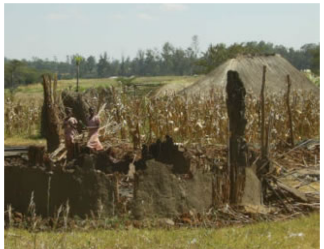
Homes laid waste and lives disrupted by pro-Zanu(PF) individuals and initiatives.