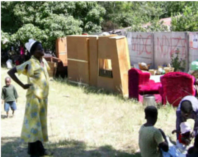
Many of the victims displaced by the violence are women and children.