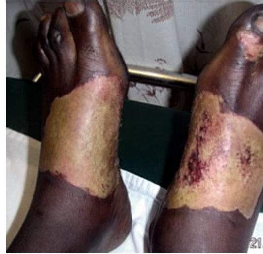
Victims of violence are being prevented from accessing medical assistance by ZRP.