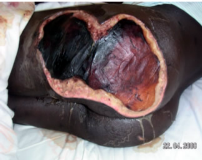
Injury exacerbated by withholding of medical treatment.

The photo on the left is of a man from the Mudzi area, Mashonaland East who was brutally beaten on the buttocks by Zanu PF militia for being an MDC supporter. This occurred on Apr 14. He was taken to the local government hospital who dressed his wound and gave him Panadol (that was all they had). Ambulances sent to the area to uplift him and 5 other injured people were turned back by CIO operatives. The ambulance crew were told that if they valued their lives they would turn back. The CIO vehicle followed them for over 100 kms to Harare.