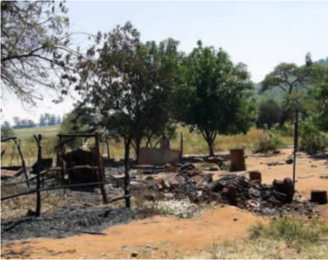
People and their belongings scarred and homeless.