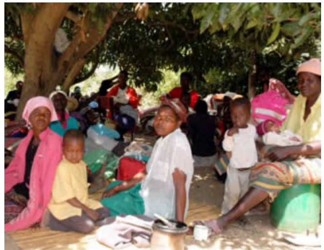
Vulnerable people left without shelter or livelihood by violent Zanu (PF) supporters.