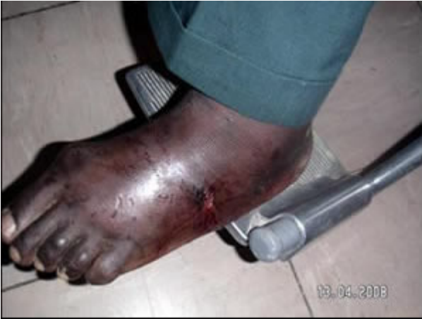
This man has a badly broken foot.