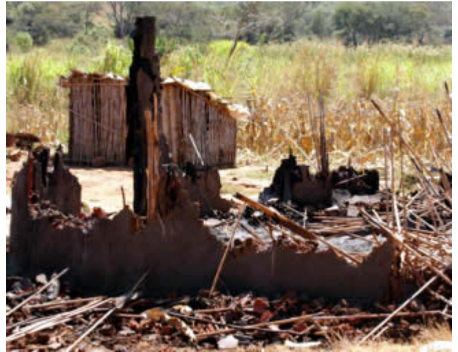
Wanton destruction of homes and property on Muniya (formerly Envant) Farm.

Many of the evicted farm workers are sleeping in the open, surrounded by whatever belongings they were able to take out with them. There are 106 children under the age of 12 and 113 adults, many of whom are elderly. They share a single toilet and have limited access to running water.