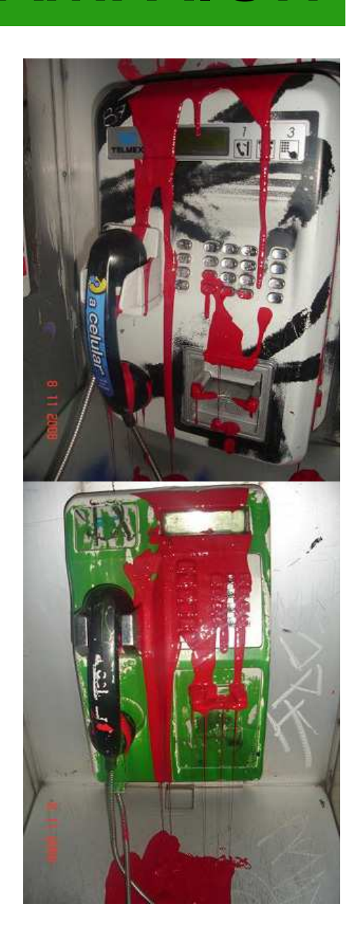
mexico city november 9, 2008 *